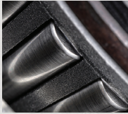
Bearings & Power Transmission