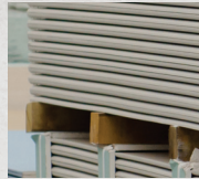
Gypsum & Building Supplies