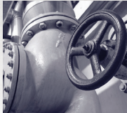
Pipe, Valves & Fittings